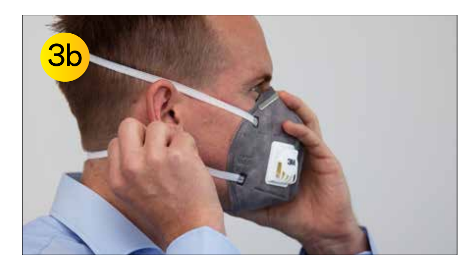
3b. Pull the bottom strap over the crown of your head and position it around the neck and below your ears. Straps must not be twisted.