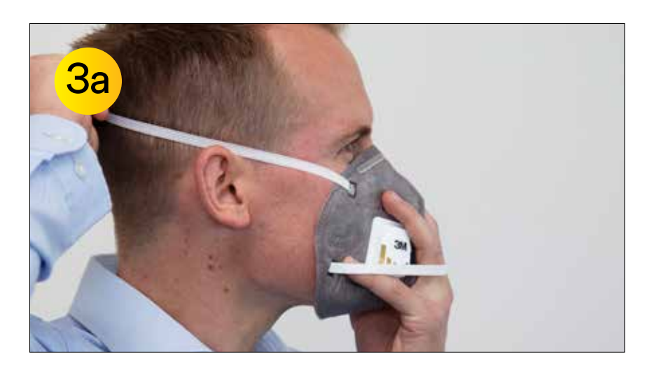
3a. Pull the top strap resting it high over the crown of your head.