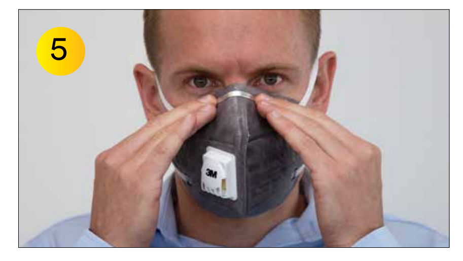
5. Using both hands, mould nose clip to the shape of the nose bridge by pushing inwards while moving your fingertips down both sides of the nosepiece.