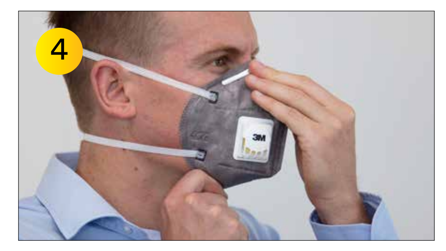
4. Ensure respirator is completely opened on your face and its edges lay flat against your skin. Adjust respirator for a comfortable fit by pulling bottom edge under the chin while holding top edge on the nose.