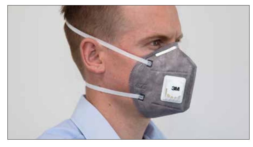
The respirator is correctly worn as shown here.

Also follow "Warning about Face Fit Check" guideline to right.